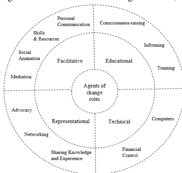
Figure 3 The role of change agents in community empowerment using ICT at Desa Kaliabu

In addition to introducing of the logo designer profession, AB also became the initiator of the establishment of youth community in Desa Kaliabu called rewo- rewo. This community stands because of the conflict between the designers because of plagiarism. Although the survival of this community was later hampered by differences of interest, but the emergence of this community also makes the more familiar the profession of logo designer in Desa Kaliabu. When active, rewo-rewo community routinely meet with experts to improve their skills in becoming logo designers. Thus, the rewo-rewo community is